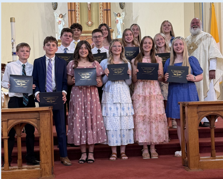
Our 8th graders celebrated their promotion Mass on Wednesday evening of this week. We wish them well as they enter high school!!