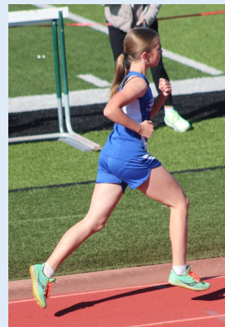
Our middle school students had a great track season.