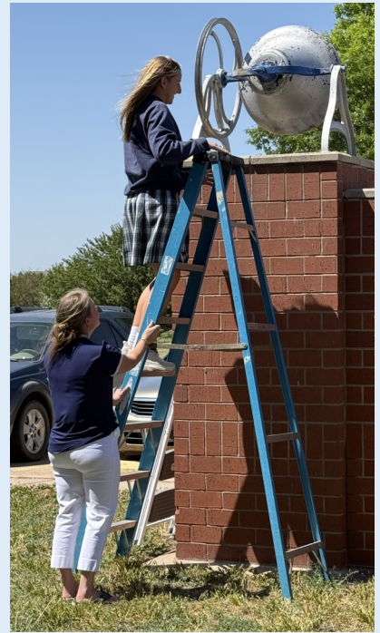
Another fun tradition for our 8th graders: ringing the bell on the last day as an 8th grader!!