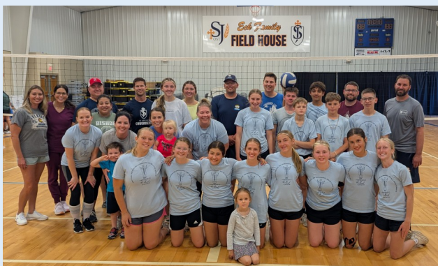
The 8th graders and their parents participate in a volley ball game during field day (another tradition). The 8th graders beat the parents in two matches.