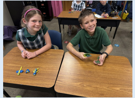
2nd graders created animals/plants that live in water habitats, such as a pond, river, delta, or tide pool.