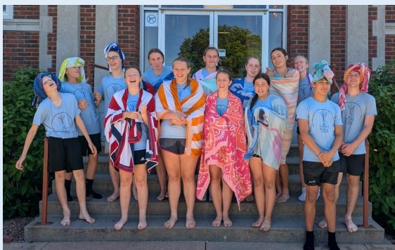
The 8th graders getting soaked under the flushers during field day (8th grade tradition).