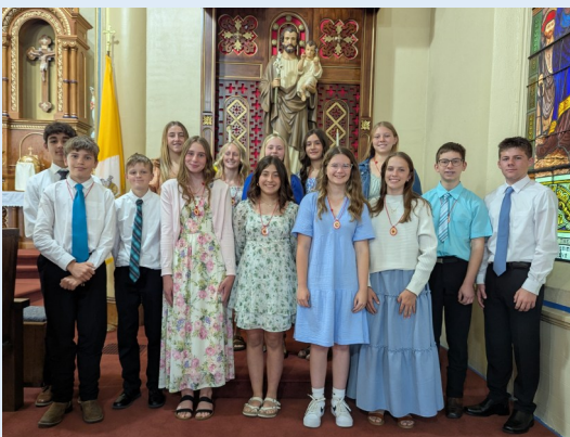
We honored Mary and St. Joseph the Worker at an all school Mass on May 1st.