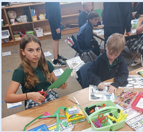
Our 5th graders helping 1st graders make toolboxes for St. Joseph the Worker.