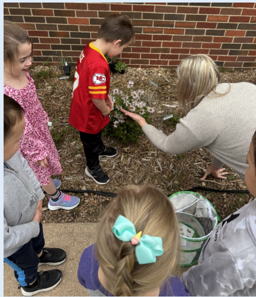
The preschoolers hatched Painted Lady Butterflies and released them this past week.