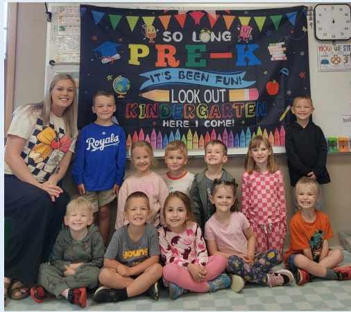
Our M/W/F preschool students are ready for Kindergarten!!