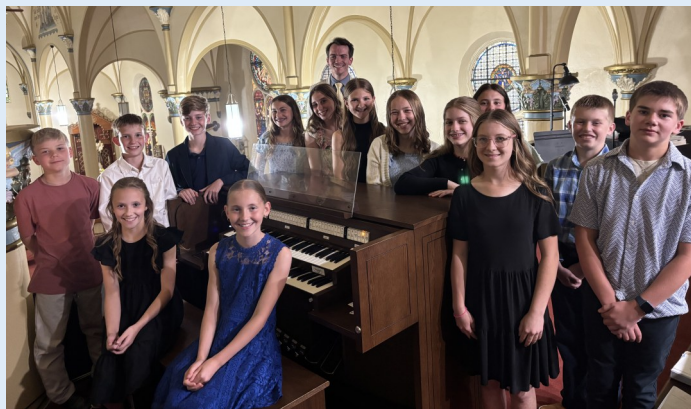
The organ students were fantastic at their organ recital this past week.