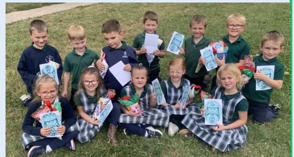
Kindergarteners learning about the organ.