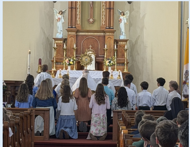
8th graders final Adoration as a student of St. Joe, Ost.