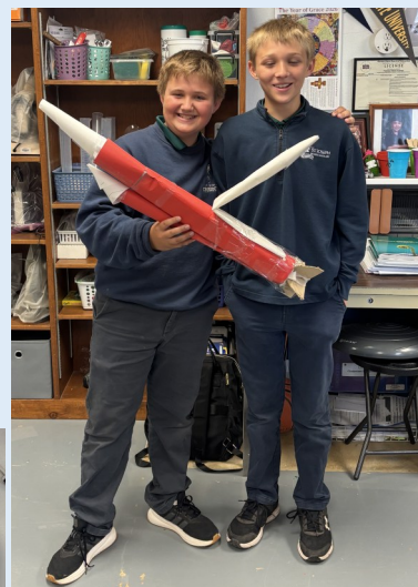
6th graders finished up a project on the Artemis II mission where they made models of the