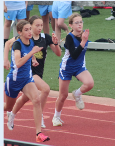
6th-8th grade track meet on Saturday, April 25th