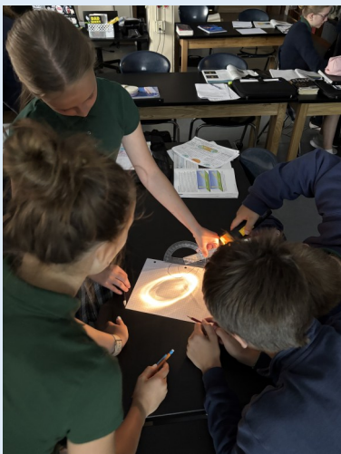
6th graders studying sunlight during the