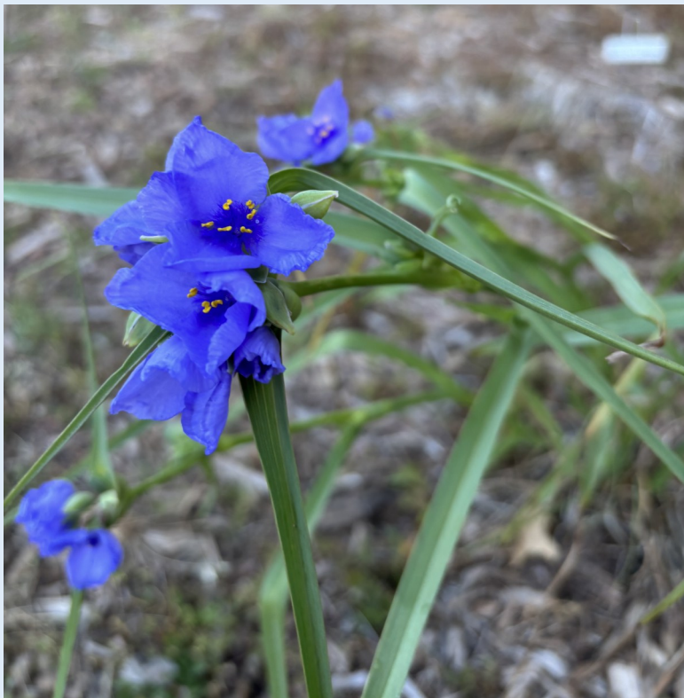
The Prairie Spiderwort in full bloom in the garden outside the