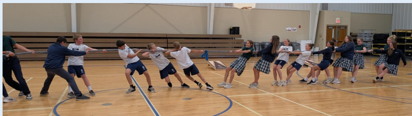
6th grade girls beating the 6th grade boys in