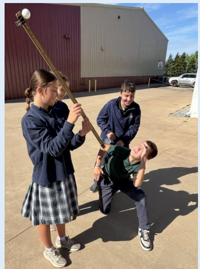
6th graders modeling eclipses in Science.