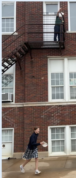
7th graders studying air resistance making parachutes.