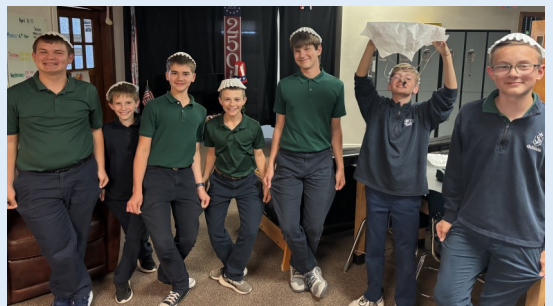
7th grade boys just being silly.