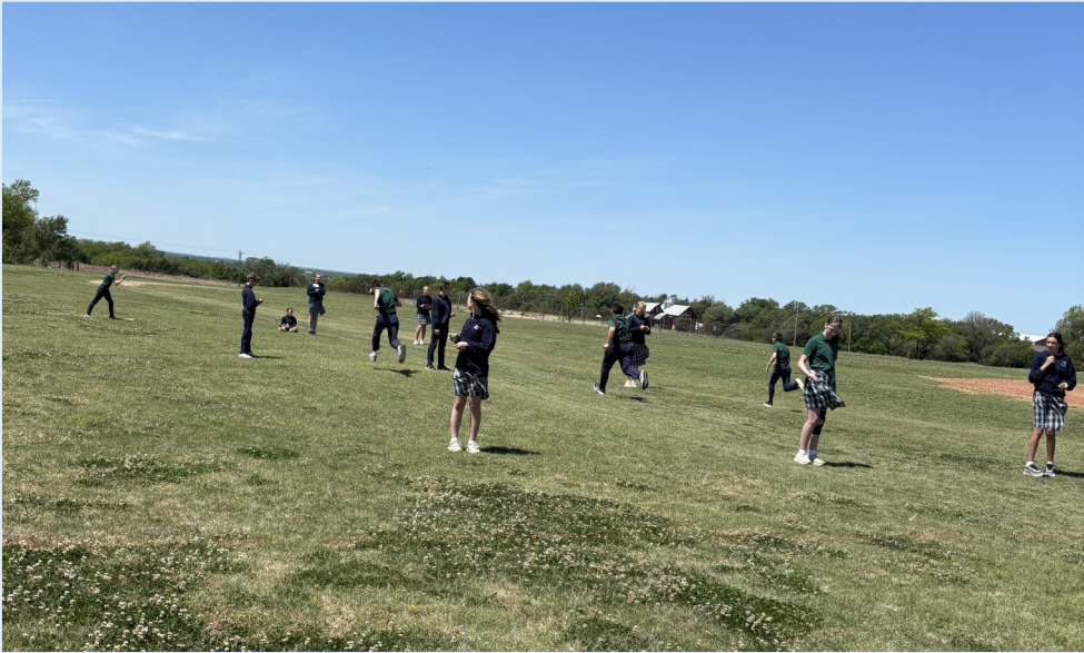
7th grade examining the max velocity of a runner.