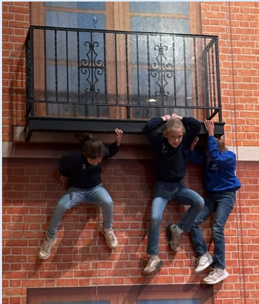
Our 3rd and 4th graders took a field trip to Exploration Place and had a GREAT time!!