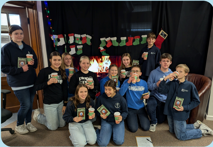
The 8th graders say by "the fireplace" in the Crusader Commons, sipping hot chocolate and reading A Christmas Carol. That should put us in the Christmas spirit.