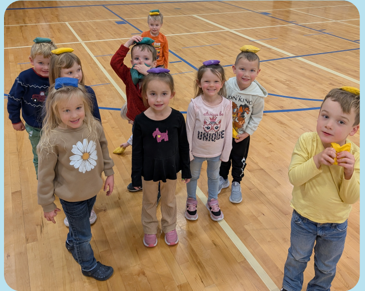
Preschool beanbag fun in PE class!

In the month of December, Mary is placed in a classroom or common area of the school. There is an "act of kindness" in Mary's pouch, in which the students are encouraged to demonstrate. Please enjoy the example of when 5 th grade found Mary in their classroom!