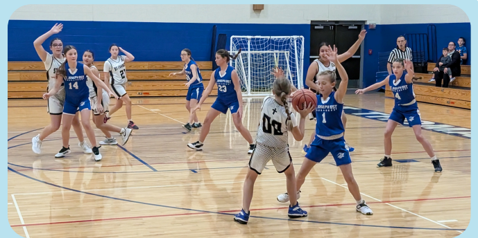
The 6th grade girls basketball team wrapped up their successful season this week. They had a great year, working hard and playing exceptionally well together! We're all very proud of their efforts and teamwork!