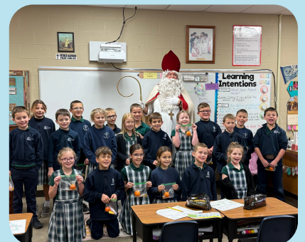
St Nick visiting our students!