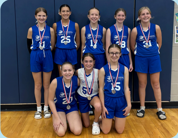
7th grade volleyball team took 2nd place in their end of season tournament. Congratulations ladies!