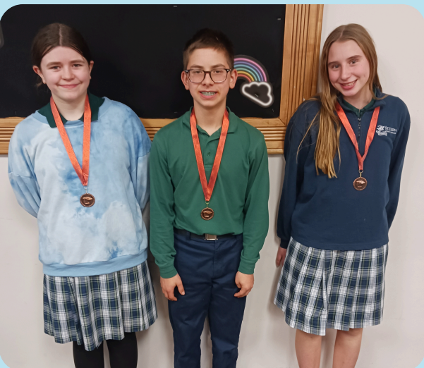
8th grade scholars bowl 3rd place finish (out of 10 teams)