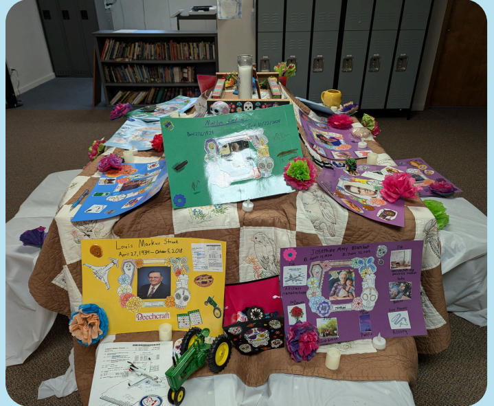
The 6th grade class learned about the traditions surrounding Day of the Dead. It is very tightly connected to All Souls Day and praying for the souls of those who have gone before us. The students researched family members and presented the information to the class, then we prayed for each person by name. Stop by the Crusader Commons to see our "offrendas" dedicated to remembering