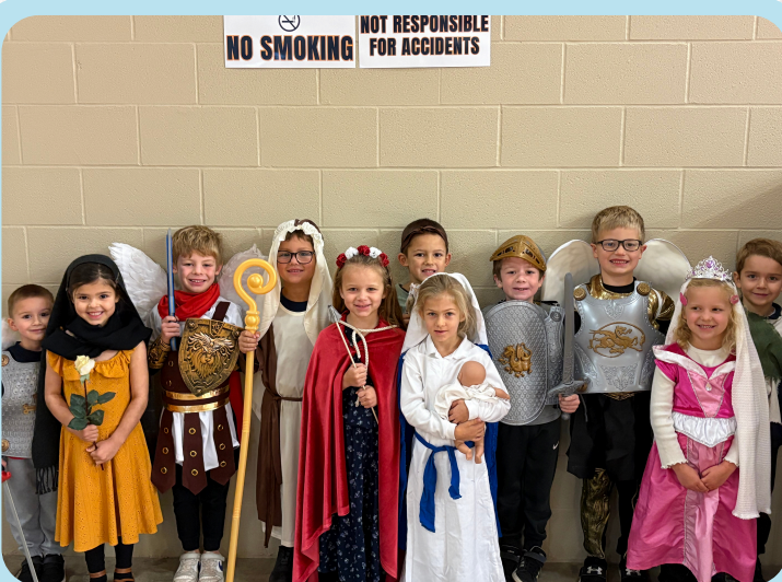
The kindergarteners looked so great in their saint costumes!