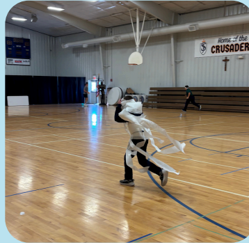
7th Grade Fall Party!