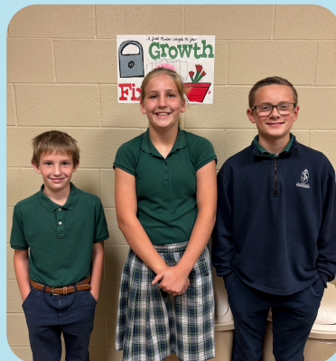
7th graders made posters to inspire the school to have a growth mindset!