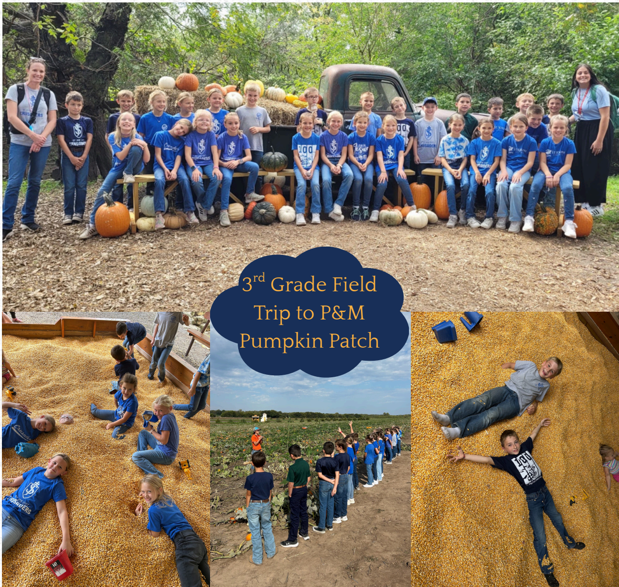
3 rd Grade Field Trip to P&M Pumpkin Patch