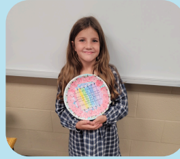
1st Grade made wreaths to celebrate Johnny Appleseed Day