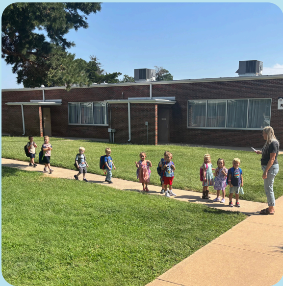
4 year old Pre-K leaving after an exciting first day of school!