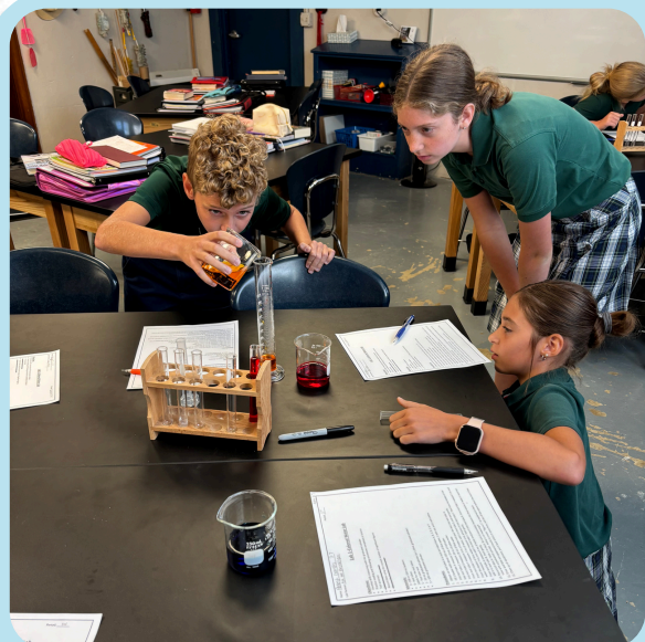
7th graders practicing measuring skills in Science.