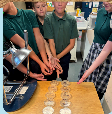
8th grad experimented with "does soap/sanitizer work?"