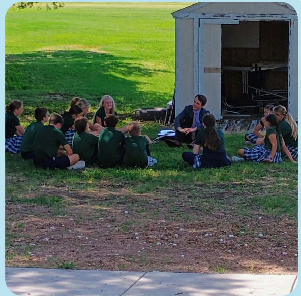
Music on the lawn