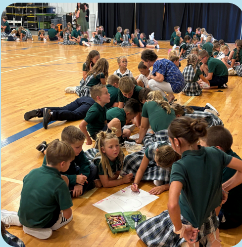
Crusader crews getting to know each other and making posters