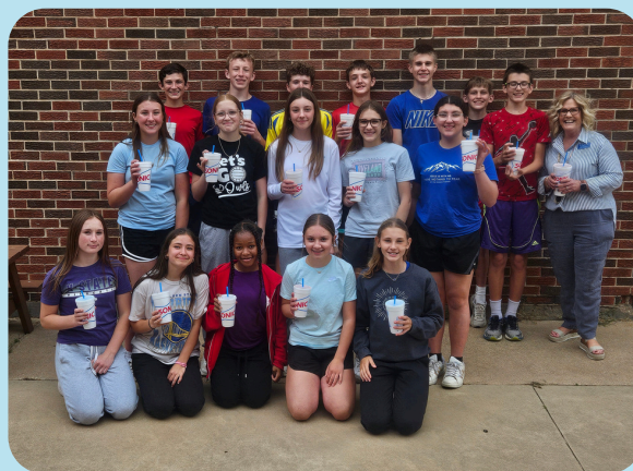
8th grade penny wars rewards