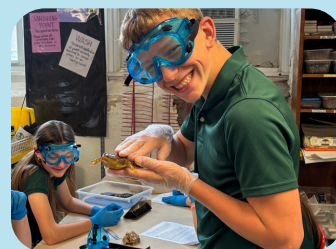
8th grade dissecting frogs.