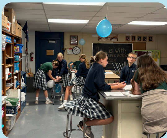
7th grade looking at electric force with balloons