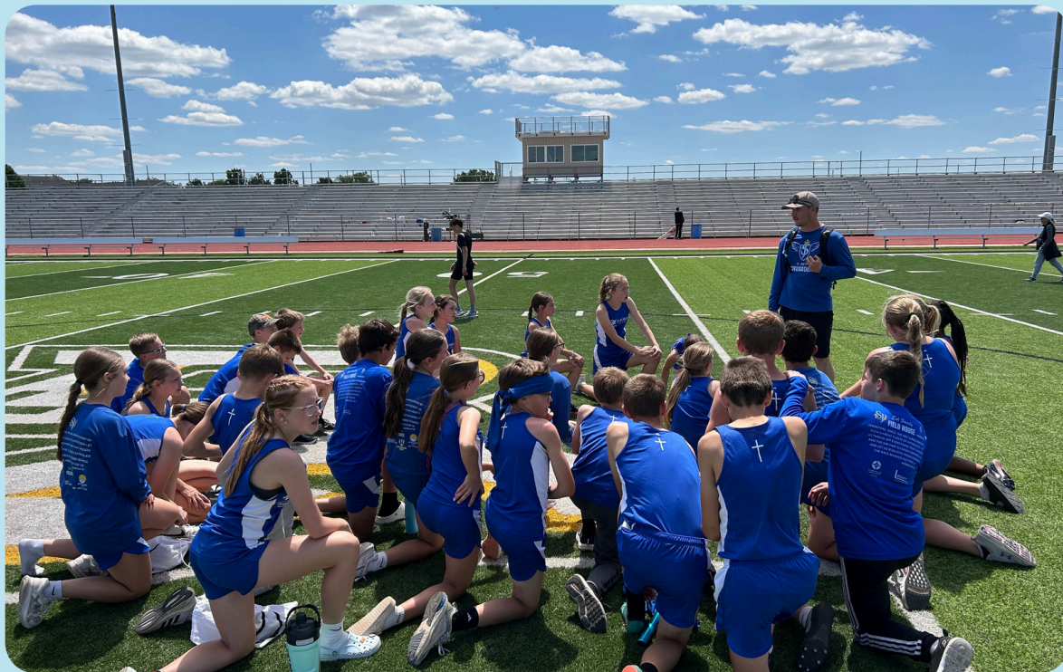
Middle school track meet! Great job, Crusaders!