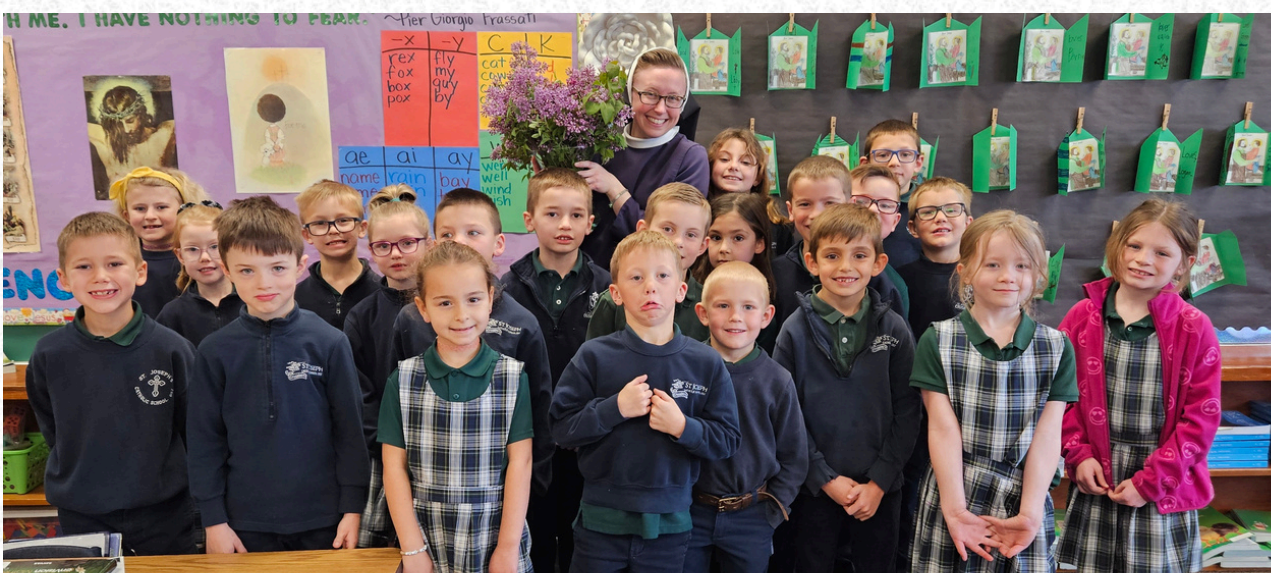
Sister's feast day surprise from Mrs. Day