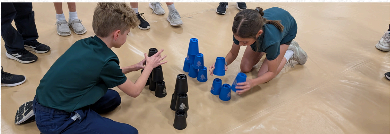
6 th grade cup stacking tournament