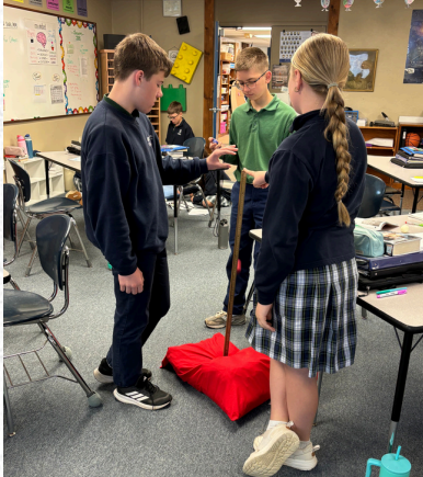
7 th grade investigates mass and falling objects