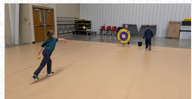
PE throwing stations