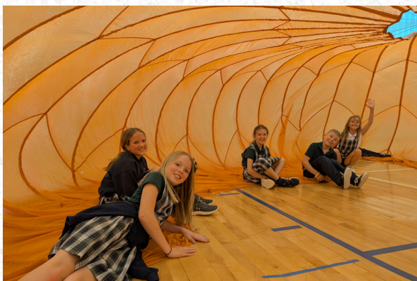
Parachute teamwork in PE