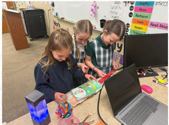
Second grade combined started a new math chapter on measurement