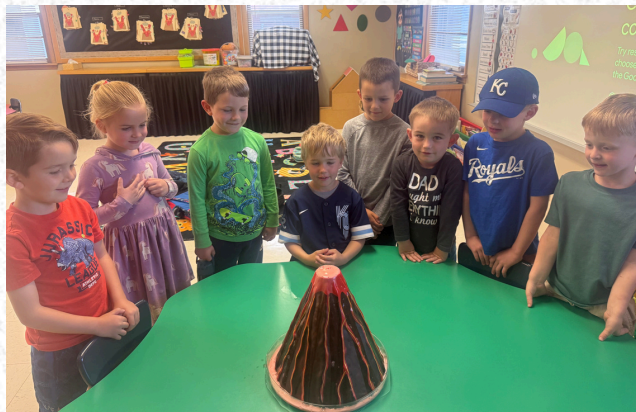
4yo preschoolers learned about volcanos for the letter V this week.