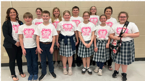
5th and 6th Grade Battle of the Books. Our first competition 5th grade took 2nd place and 6th grade took 1st! Congratulations to both teams!