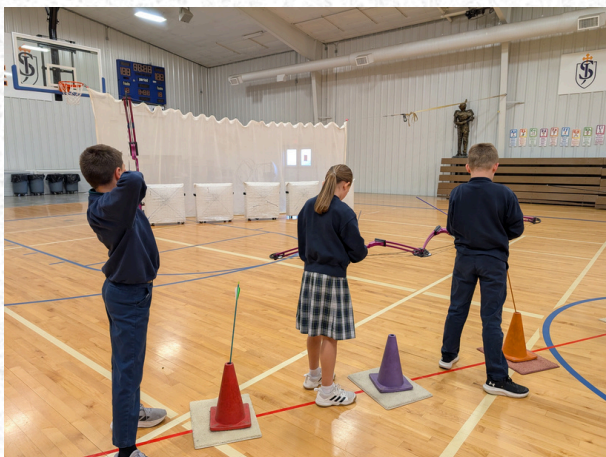
Archery in PE