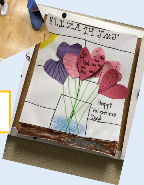
Our halls are filled with some creative artwork.