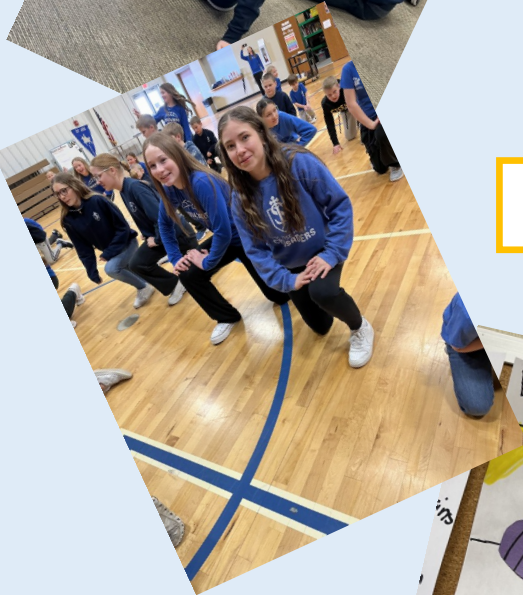
Crusader Crews were a BIG hit!!