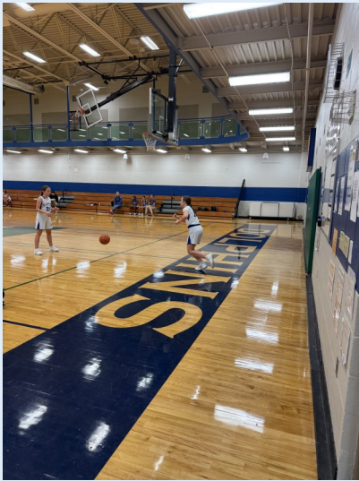
8th grade basketball