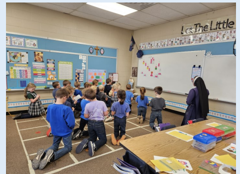
1st graders praying the Angelus.