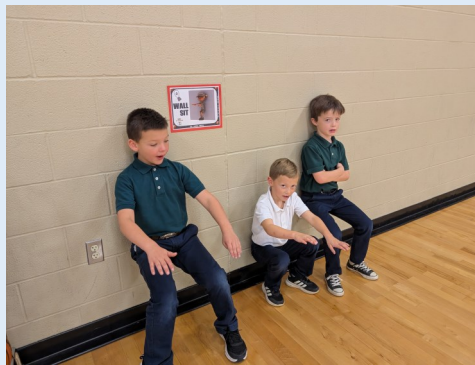
Working hard in P.E.