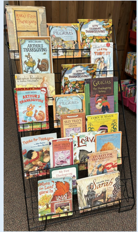
Our library has some great Thanksgiving Books,