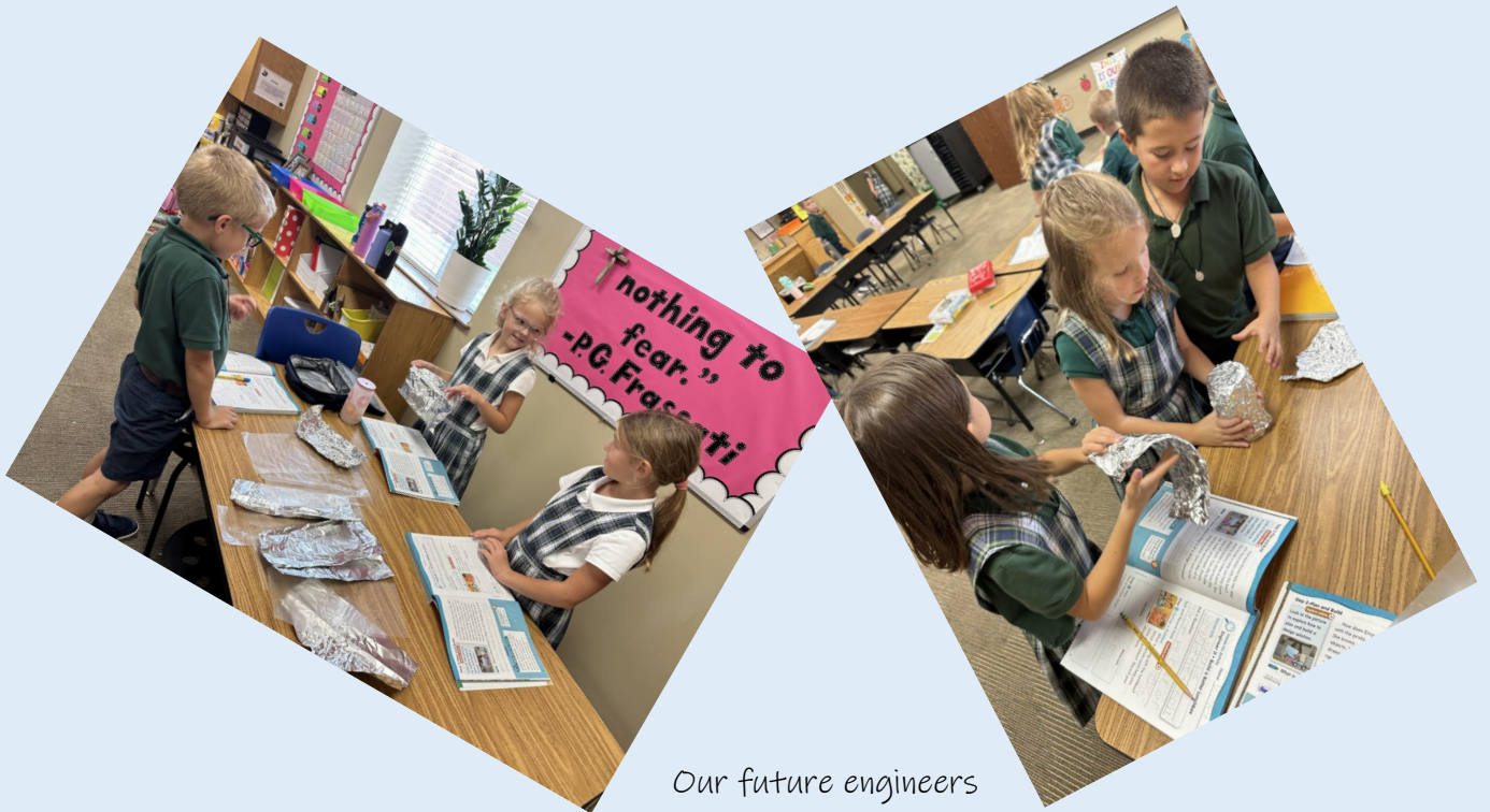
Our future engineers