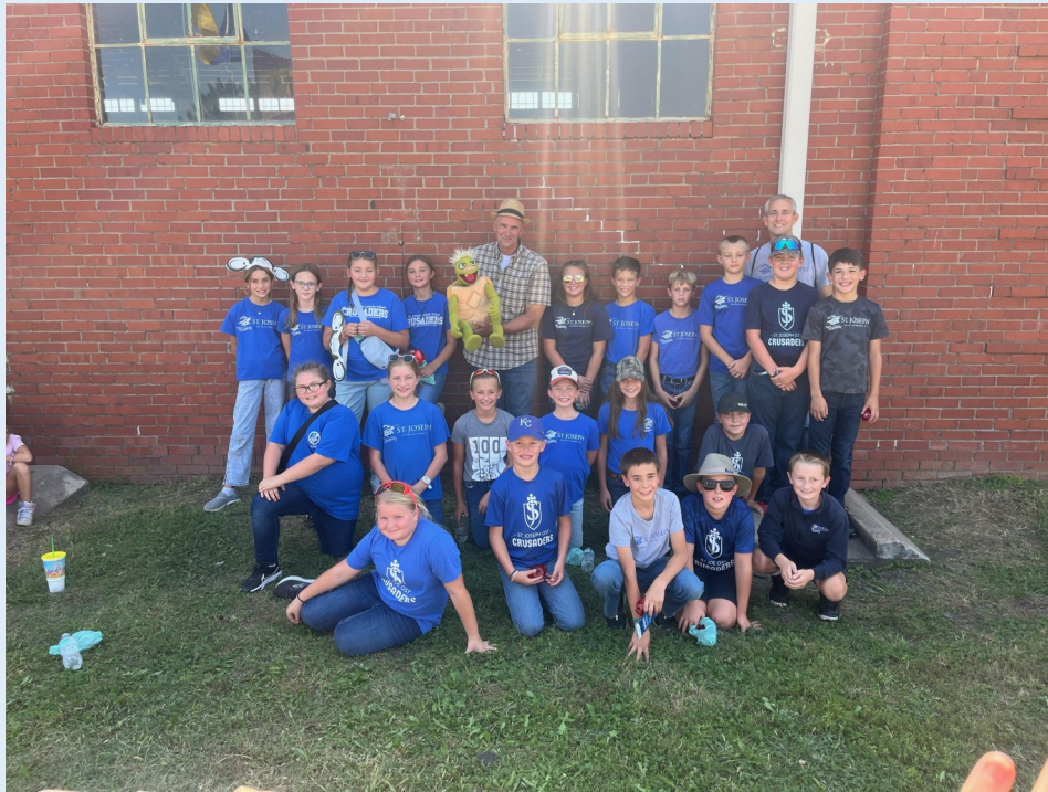
5th Grade had a great time at the State Fair!!