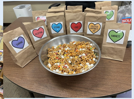
2nd graders making friendship bags!