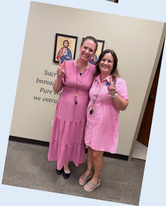
2nd Grade Team Twinning