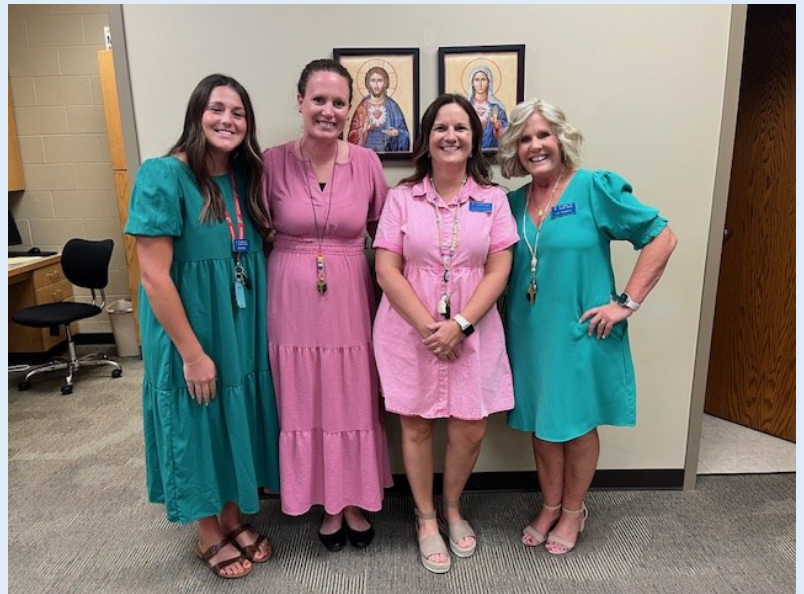
Double the twinning