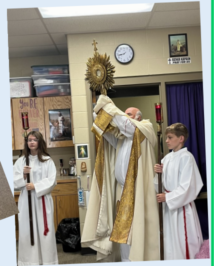
Eucharistic Procession—Blessing of the classrooms