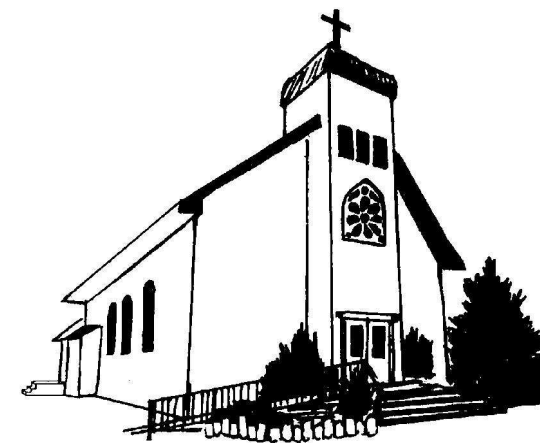
St. Rose, Mt. Vernon 4813 NE 150 Ave., Cheney, KS 67025 http://strosemv.com Sunday, 11:00 am