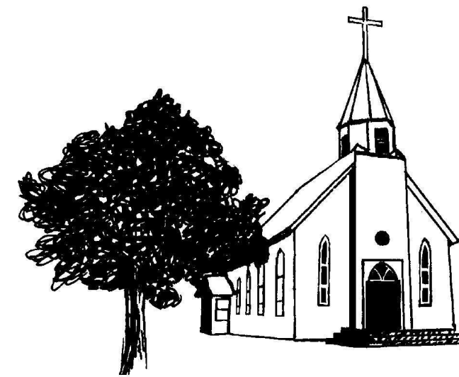
St. Louis, Waterloo 9800 NE 20 th St., Murdock, KS 67111 http://slwaterloo.com Saturday, 5:00 pm