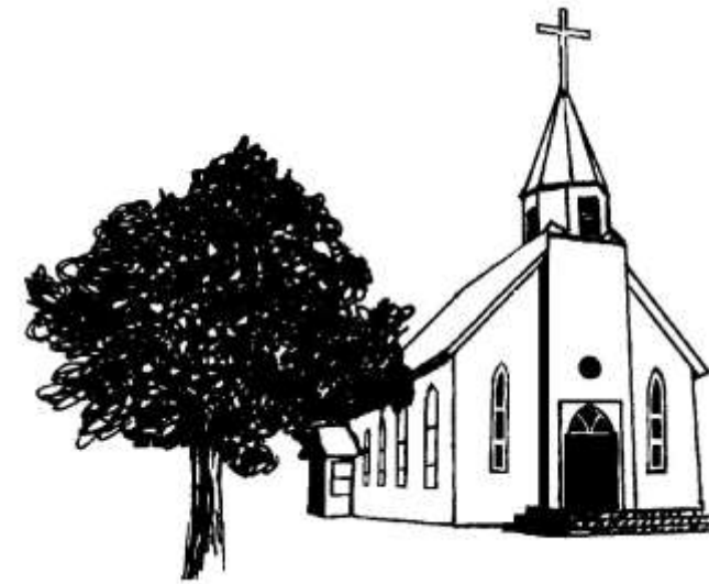
St. Louis, Waterloo 9800 NE 20 th St., Murdock, KS 67111 http://slwaterloo.com Saturday, 5:00 pm