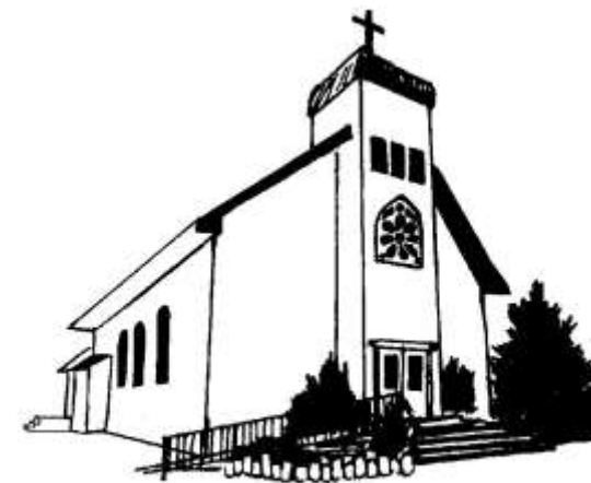
St. Rose, Mt. Vernon 4813 NE 150 Ave., Cheney, KS 67025 http://strosemv.com Sunday, 11:00 am